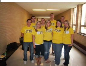
Gamma officers getting ready for a fun day at nationals

Nine of this year's officers ventured to Mt. Pleasant, MI, for Gamma Iota Sigma's 39 th Annual Management Conference. The event was hosted by the Nu chapter at Central Michigan University from October 1 st -3 rd . The sessions informed attendees about the professional insurance industry as well as Gamma Iota Sigma initiatives. Industry presentations ranged from discussions on catastrophe coverage and claim procedures to underwriting initiatives during hard and soft markets. The networking between other chapters really helped us brainstorm new and innovative ideas for the semester!