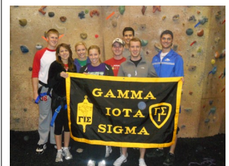
Gamma Iota Sigma members having some fun and team building while rock climbing at Upper Limits

They also cleaned the Hidden Creek Nature Sanctuary and began really getting their hands dirty as they cleaned up around the forest. It was a gratifying feeling for us to be able to go out and help the community in any way we can, and we also were able to enjoy a nice day walking the trail.