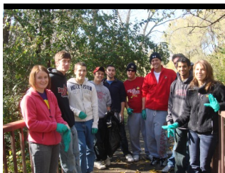
Gamma members cleaning the Hidden Creek Nature Sanctuary

On Friday afternoon October 29, Gamma members took some time away from studying to help clean up the community. The students met at the College of Business and gathered supplies of rubber gloves and garbage bags to begin picking up trash throughout the quad. They made their way over to the Constitution