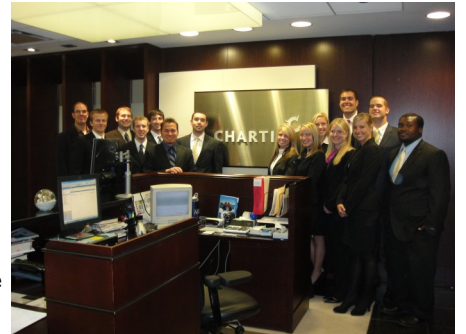
Gamma members visiting Chartis