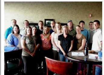
Gamma Iota Sigma members, enjoying a Peoria Chiefs game with RLI